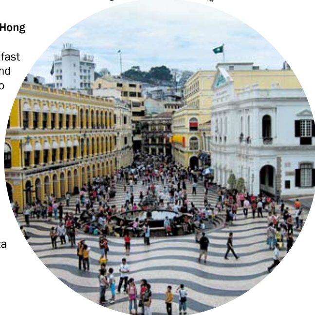
Senado Square – Macau

After an American breakfast proceed on an exciting city tour of Macau. Visit the famous A-Ma temple, from where the name Macau is derived. This temple is