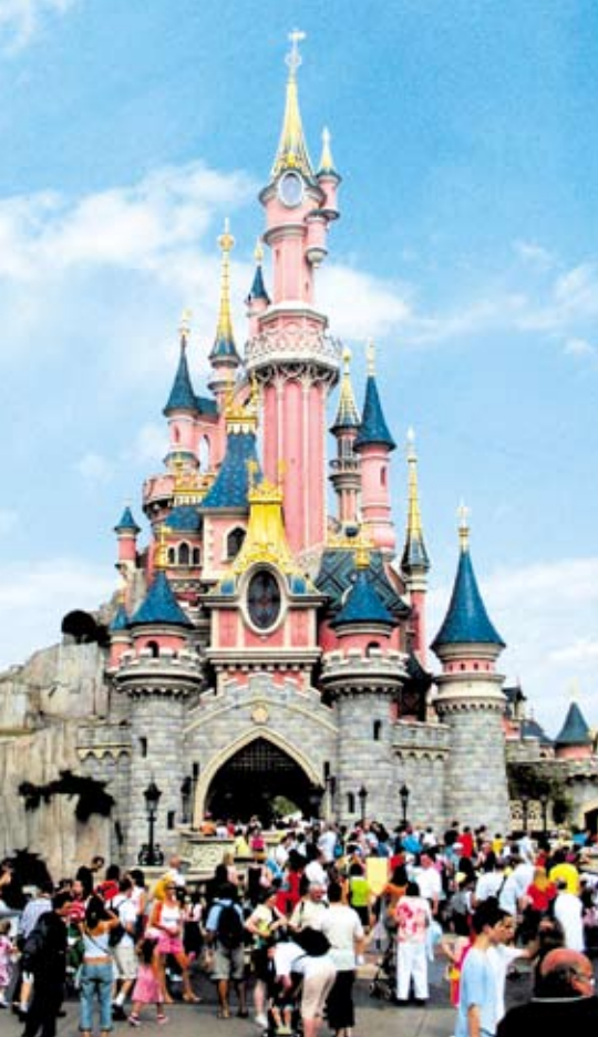
Disneyland, Hong Kong

After an American breakfast at your hotel, proceed to the airport for your flight to Shanghai. On arrival proceed to your hotel and check in. Later proceed for the exciting Huangpu River cruise. View the magnificent lights that illuminate this River city. Tonight enjoy an Indian dinner. Overnight at Hotel Ramada/Holiday Inn or similar in Shanghai.