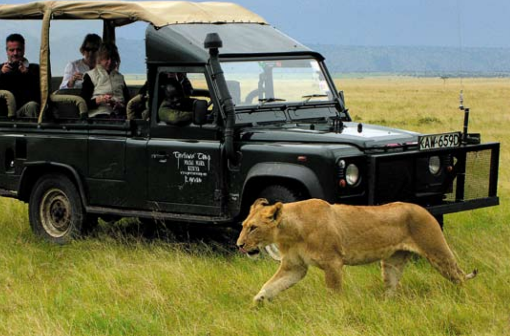
Game Viewing – Masai Mara

check in at the lodge. The Mara offers wildlife in variety and abundance that it is difficult to believe; over 450 species of animals have been recorded here. In the afternoon, enjoy an enthralling game-viewing drive. Spotting Lions, Rhinos, Hippos, Crocodiles, Giraffe, Wildebeests, Zebras, Buffaloes, Warthogs, Hyenas, Jackals, and a variety of antelopes is the highlight of your day. This evening, enjoy a sumptuous Indian dinner at your lodge. Overnight at Mara Sopa Lodge or similar in Masai Mara.