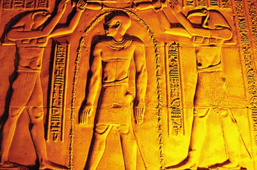
Temple of Kom Ombo

temple of Amenophis III. Enjoy lunch on board the cruise. Also visit The Temple of Deir El-Bahri. The Temple consists of three imposing terraces. The two lower ones would have once been full of trees. On the southern end of the 1st colonnade there are some scenes, among them the famous scene of the transportation of Hatshepsut's two obelisks. Enjoy dinner on board the cruise. Tonight enjoy dinner. Overnight on board the Nile cruise.