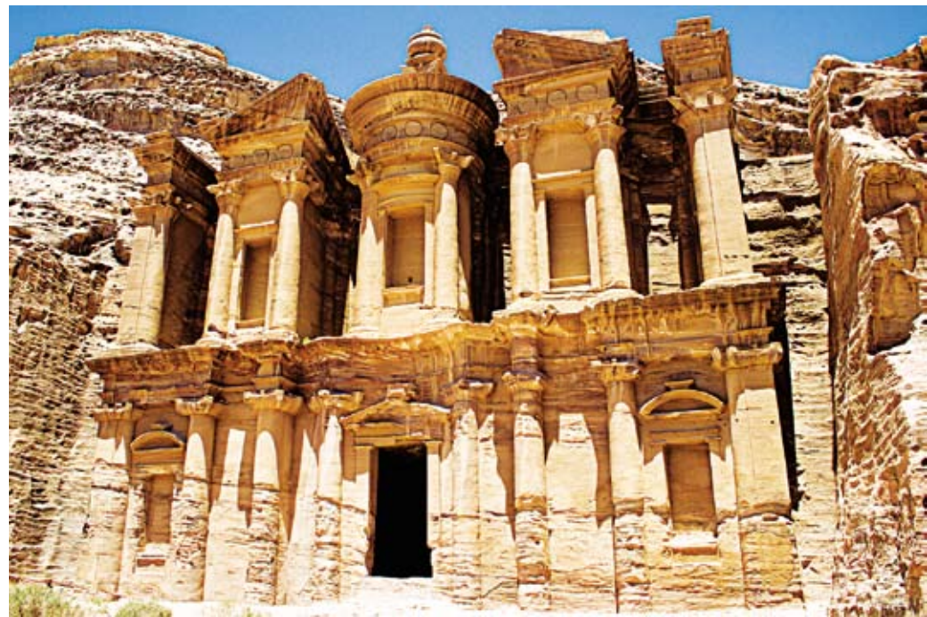
Monastery at Petra

to explore the West Bank of Luxor. We proceed deep into the desert to discover the Valley of Kings. This is the place where generations of pharaohs and nobles were buried in great splendor, housed in crypts cut into the cliffs. The treasures of the burial chambers of great kings and queens have long been looted by ancient Egyptians and visitors over many centuries. Yet, there is magic in the tombs of the great kings with their imposing architecture and marvelous paintings. Even after over 5,000 years, the paintings retain their original colours and tell the story of civilization gone by. On our return, we take a photo-stop at the Colossi of Memnon. These two giant statues are all that remain of the mortuary