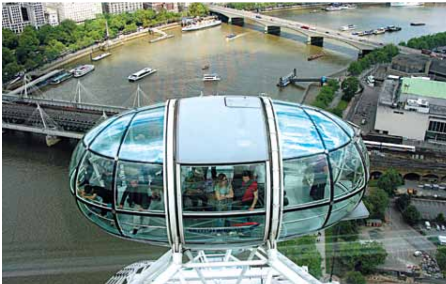
Aboard the London Eye