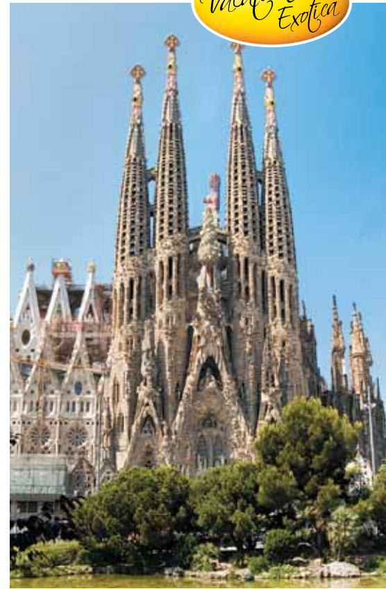
Sagrada Familia – Barcelona

After a buffet breakfast at the hotel, check out and proceed to the airport for your flight to Barcelona. On arrival at Barcelona