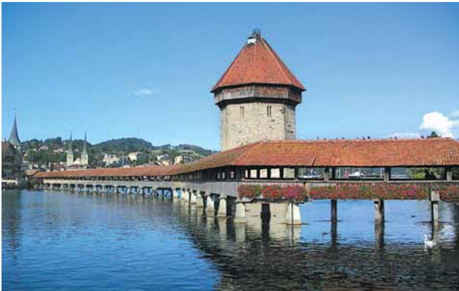
Kapell Brucke – Lucerne

drive to Zurich – The Commercial Capital. Enroute lunch will be provided. On arrival, enjoy a tour of this city and see the bustle of the city on Bahnhofstrasse and spend some time along the lake of Zurich. Tonight, enjoy an Indian dinner. Overnight at hotel Holiday Inn / Park Inn / Renaissance or similar, in Zurich.