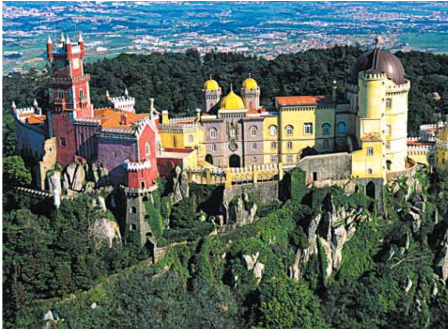
Pena Palace - Sintra

and many more interesting sights. After lunch, drive to Cascais - once a tiny fishing village and now an elegant holiday beach resort. Enjoy free time for shopping at the small shops and roadside stalls offering typical embroidery and lace, to high fashion designer products. Later