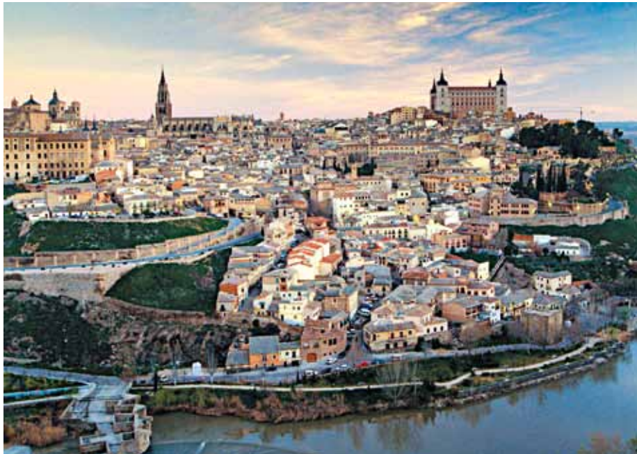
Toledo – Spain

After a buffet breakfast at the hotel, check out and proceed to Toledo where Christians, Arabs and Jews lived together for centuries. On arrival, enjoy an Indian lunch. Later on your guided tour visit the Santo Tome Church - The tower is one of the finest examples of Mudejar art. View the Puerta Del Sol – literally the centre of Spain. Next, visit the Damascene Steel Workshop where you can see metal and gold artifacts. Continue on to Madrid. On arrival, proceed to the hotel and check in. Tonight, enjoy an Indian dinner. Overnight at hotel Rafael Ventas / Conveccion or similar, in Madrid.