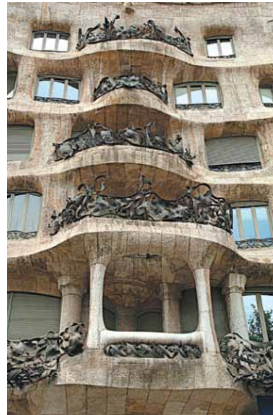
Casa Mila – Barcelona

After a buffet breakfast at the hotel, join an English speaking local guide for a full day tour of this city. Visit the magnificent Sagrada Familia - a massive Roman Catholic Basilica and Gaudi's masterpiece. The sight of this masterpiece is nothing short of dramatic.