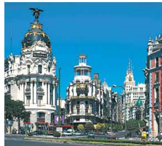
Madrid – The Spanish Capital