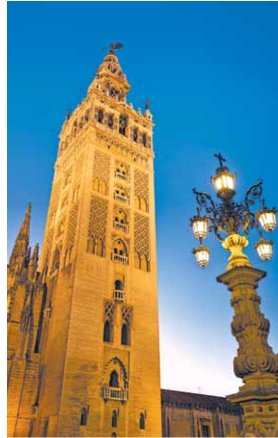
Cathedral and Giralda Tower - Seville