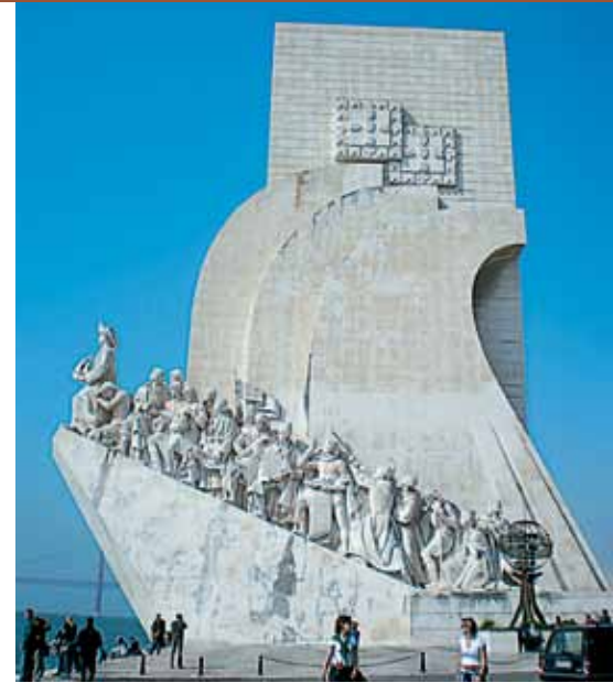
Padroa Monument – Lisbon