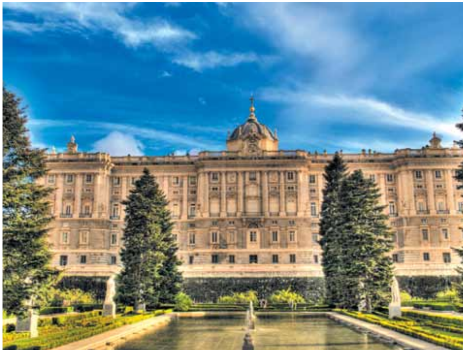
Royal Palace – Madrid

Overnight at hotel Rafael Ventas / Conveccion or similar, in Madrid.