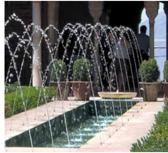
Alhambra – Granada