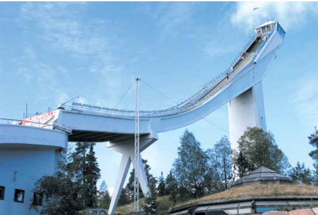
Holmenkollen Ski Jump – Oslo