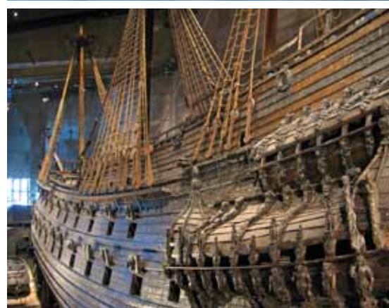
Vasa Museum – Stockholm

called "Beauty on Water", situated on an archipelago of 14 islands between Lake Mälaren and the Baltic Sea. On arrival, proceed for an orientation tour of Stockholm, including a visit to the Royal Palace. Proceed to your hotel and check in. Tonight, enjoy an Indian dinner. Overnight at hotel Quality Globe /Clarion/ Rica or similar in Stockholm.