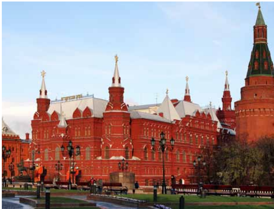
Red Square - Moscow