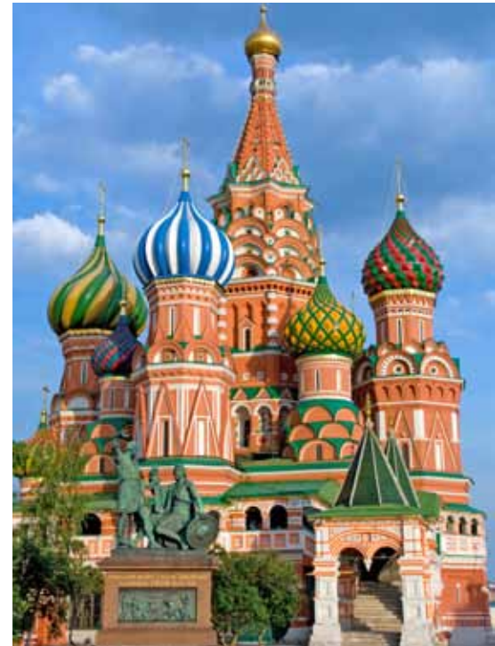
Kremlin - Moscow