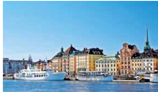
Beautiful Harbour – Stockholm

After a Scandinavian breakfast on board, disembark in Stockholm often