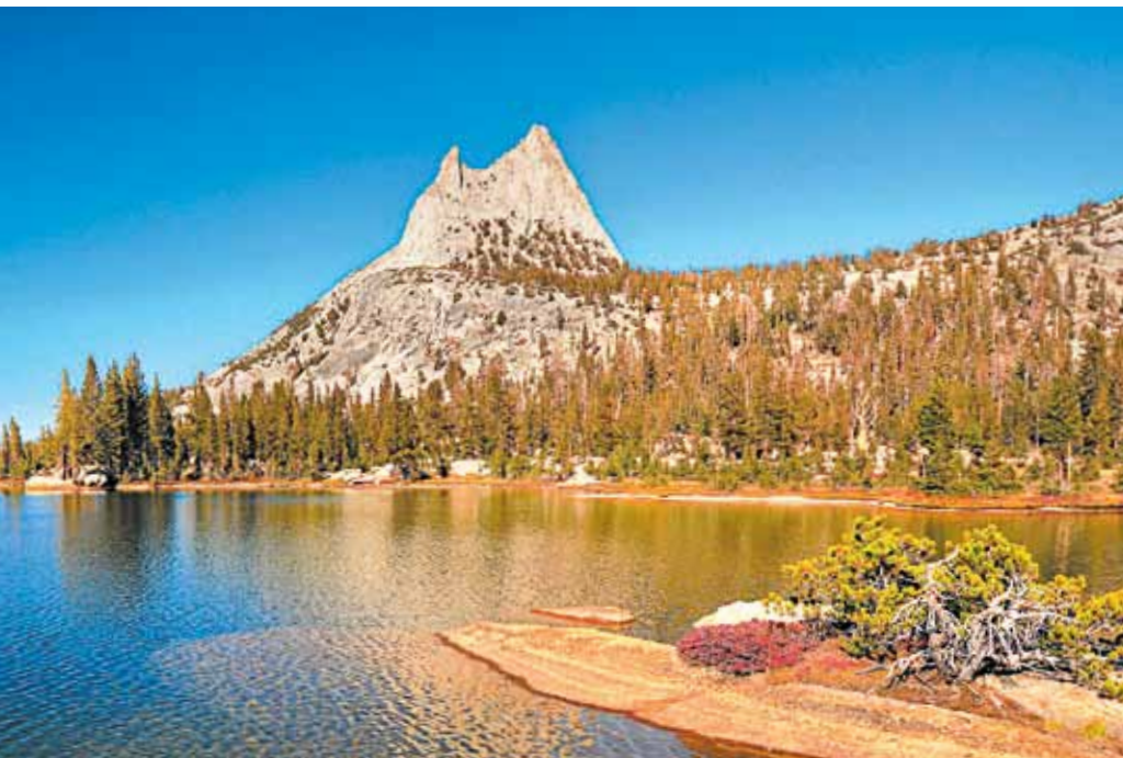
Yosemite National Park – California

After an American breakfast at the hotel, proceed to the airport for your flight back home. Return home with wonderful memories of your holiday with Vacations Exotica. (B)