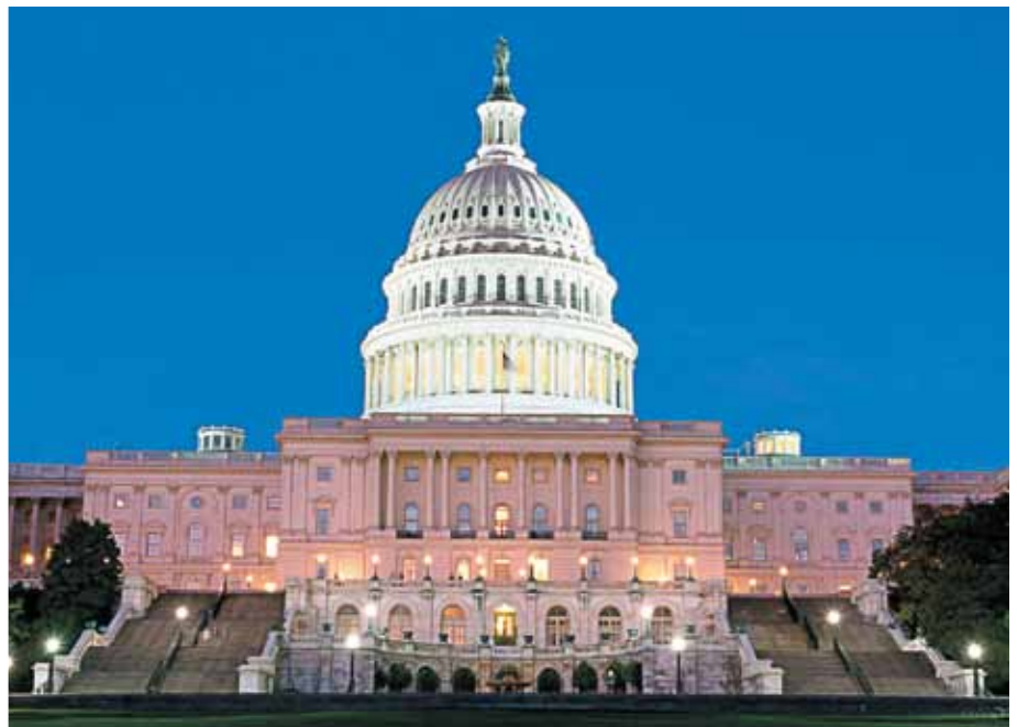
The Capitol Building –Washington D. C.

Later, drive to Washington D. C. – the Capital City. After an Indian lunch, proceed on a comprehensive guided city tour and see all the major sights of Washington D.C. Later, check-in to your hotel. After an Indian dinner proceed on a night tour of Washington D C., see the Capitol Building, the White House, the Lincoln Memorial and many more sights magnificently lit up.