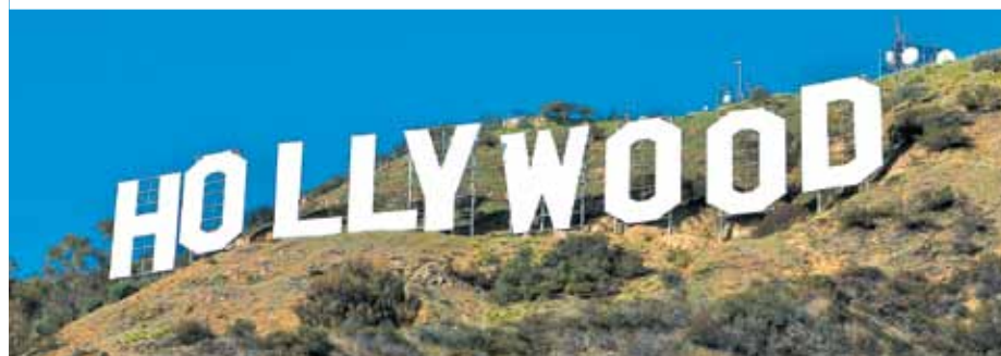
Hollywood – Los Angeles