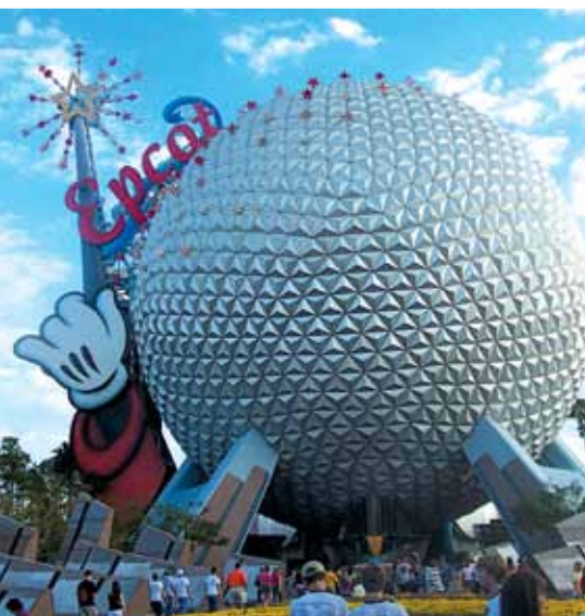
EPCOT, Walt Disneyworld – Orlando

proceed to Magic Kingdom Park – where dreams come to life.