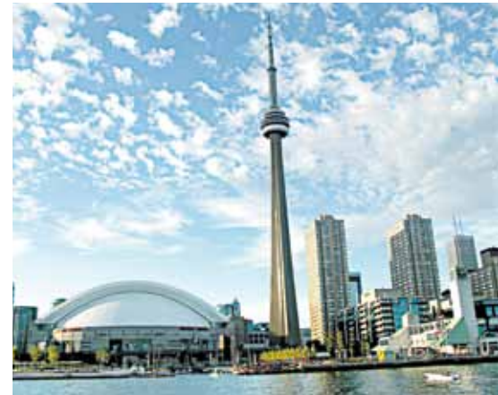
C. N. Tower – Toronto

After an American breakfast at the hotel,