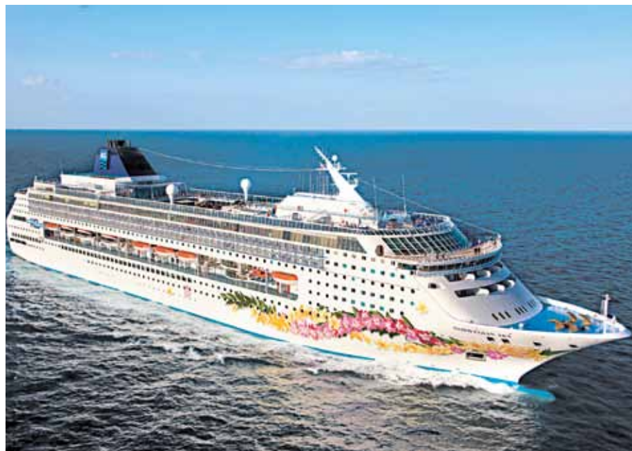
Norwegian Sky – Luxurious Cruise to the Bahamas

After lunch, you can go and explore this charming and bustling island. Here, you can join a variety of shore excursions