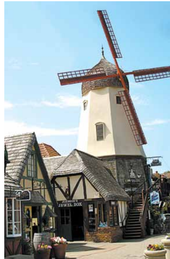
Solvang – The Danish Village in California

Later, visit Santa Monica – The Jewel of Los Angeles. Walk down the glamorous 3rd Street Promenade and experience the lifestyle of the Rich & Famous. You can also experience one of California's premier beaches – Santa Monica Beach. Later, proceed on a city tour. Visit the