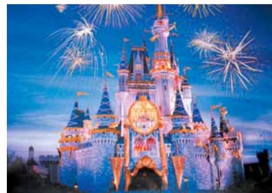
Wishes Nighttime Spectacular at Magic Kingdom