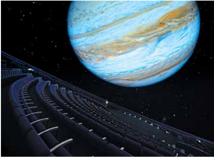
California Academy of Sciences – San Francisco