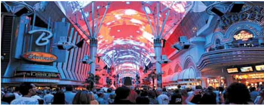
The Fre Mont Street Experience – Las Vegas

After an American breakfast at the hotel, check out and drive through the enigmatic Mojave Desert to Los Angeles - the Glamour Capital. Today enjoy an Indian/local lunch enroute. On arrival proceed to