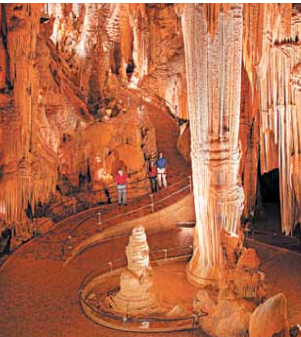
The Luray Caverns – Virginia

Overnight at hotel Sheraton On The Falls in Niagara Falls, Canada. (B, L, D)