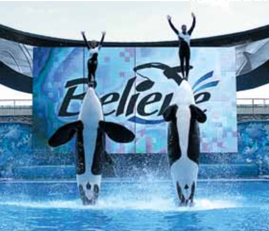
Sea World – Orlando