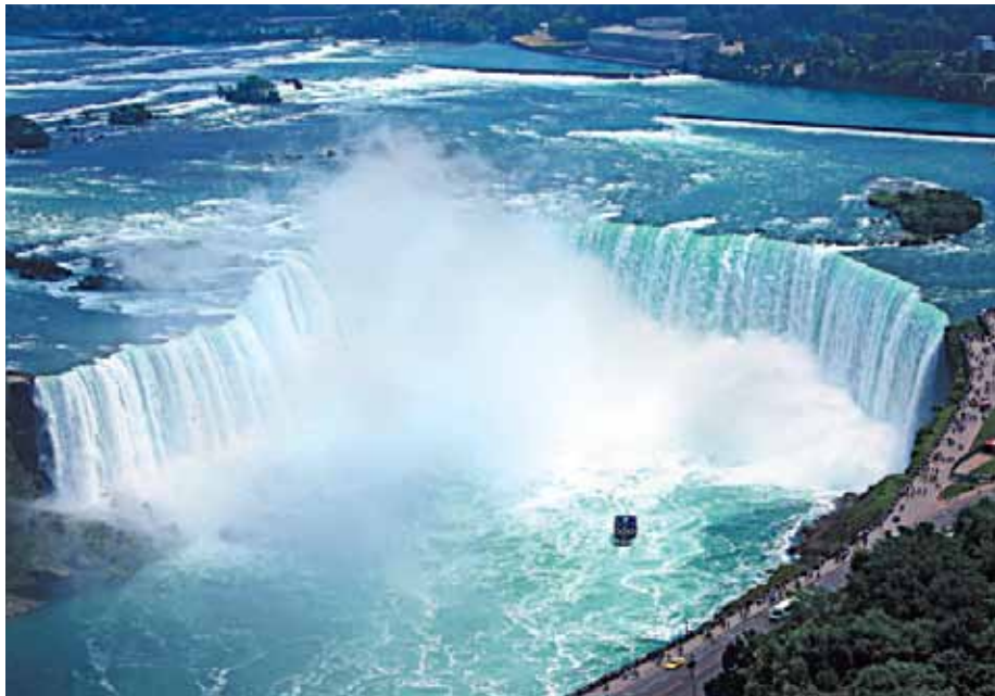
'Maid of the Mist' – Niagara Falls

Today you also experience the Journey Behind The Falls – a journey that takes you deep below and behind the heart of the Niagara Falls.