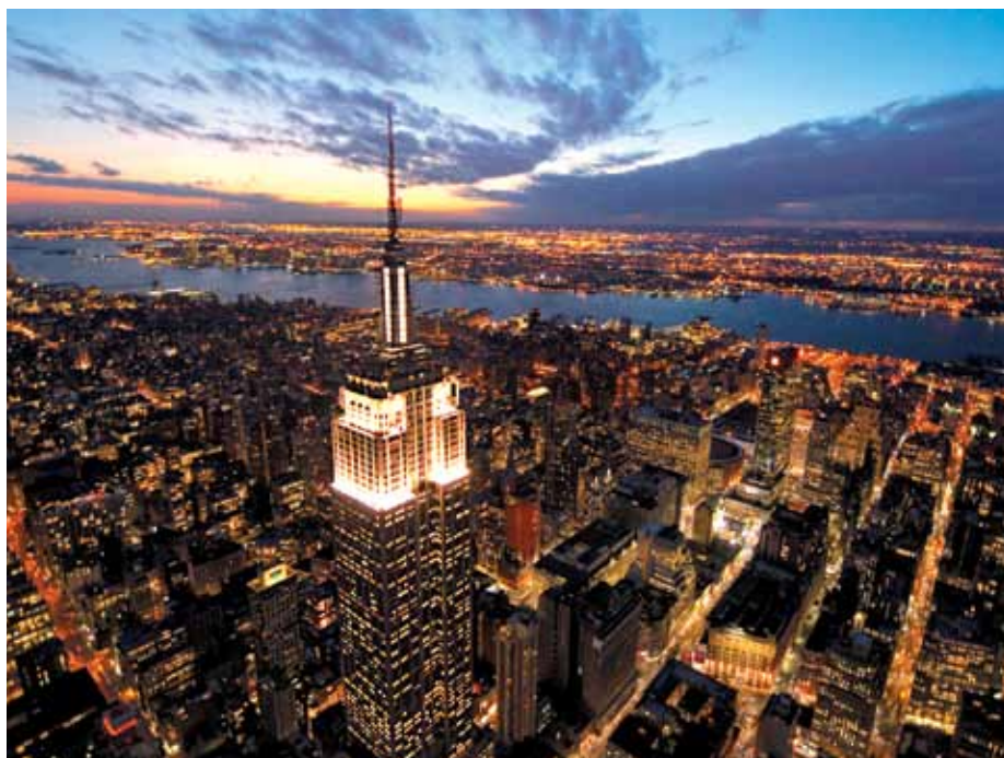
The Manhattan Skyline – New York

Later, visit the Empire State Building – go up to the 86th Floor Observatory for a bird's-eye view of the city.