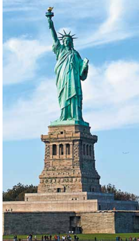
Statue of Liberty – New York

you to sights like the Brooklyn Bridge, the stunning Manhattan Skyline, the Statue of Liberty, the Empire State Building and many more sights – all lit up in dazzling lights.